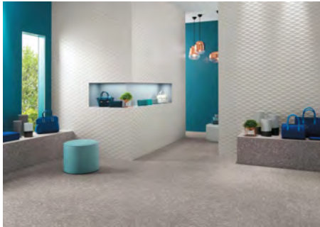
Stars - White wall