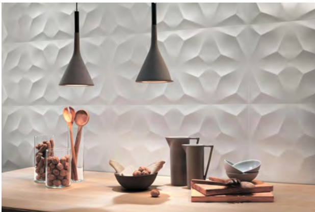
Diamond - White wall