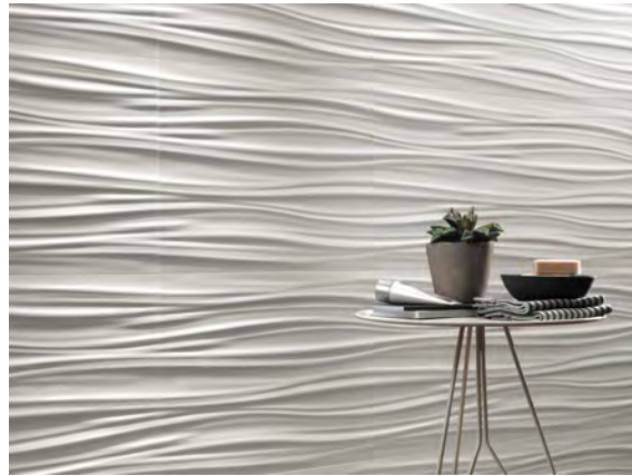
Ribbon - White wall