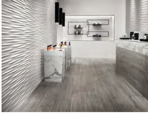
Blade - White wall