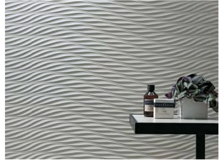
Twist - White wall