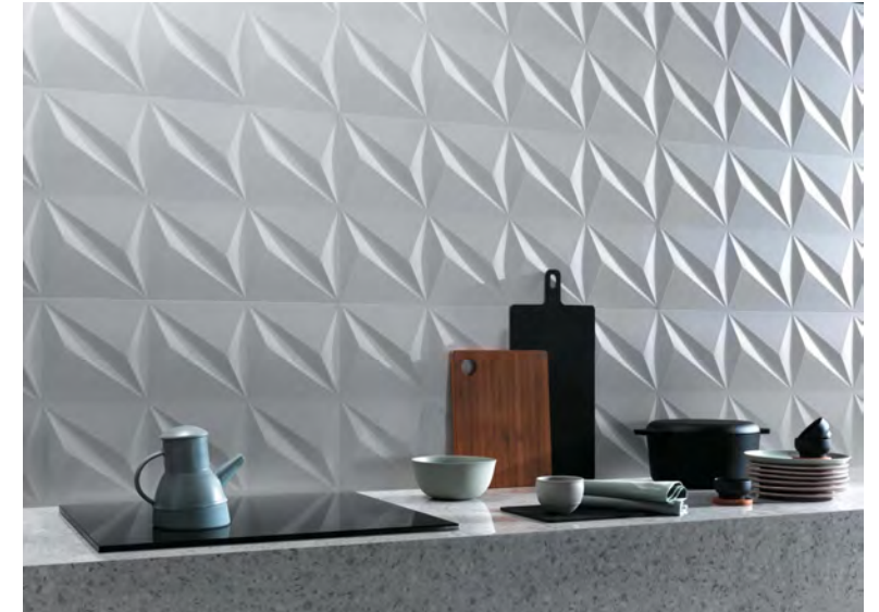
Flash - White wall